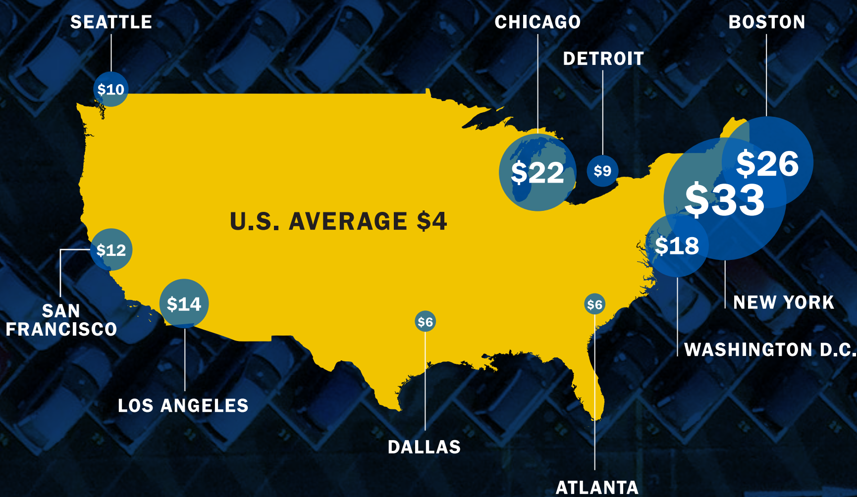
AVERAGE PARKING COST (INRIX 2-HOUR RATE) 1 MILE FROM CITY CENTER